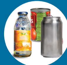
GLASS & METAL Food & beverage containers Must be empty