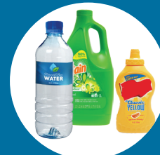
PLASTIC Hard containers / Size must be at least 4". Must be empty