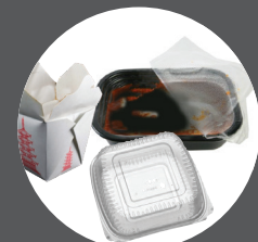
TO GO CONTAINERS & MICROWAVABLE FOOD TRAYS