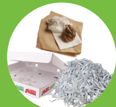
PAPER USED FOR FOOD OR DRINK