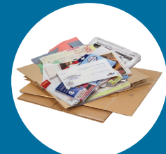
PAPER & CARDBOARD Must be dry & free of food