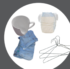
HOUSEHOLD ITEMS Hangers/wires (tangles), clothes, diapers/pet waste, toys, dishware & furniture