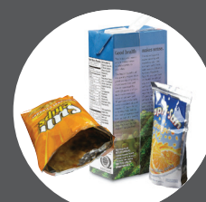
FOOD & DRINK PACKAGING