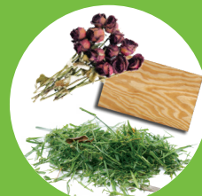
PLANT DEBRIS & UNTREATED/RAW WOOD