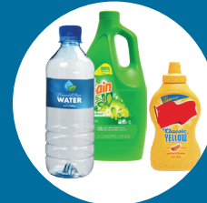
PLASTIC Hard containers / Size must be at least 4". Must be empty