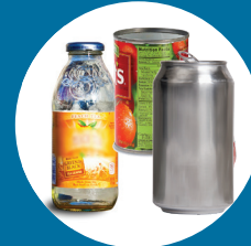
GLASS & METAL Food & beverage containers Must be empty